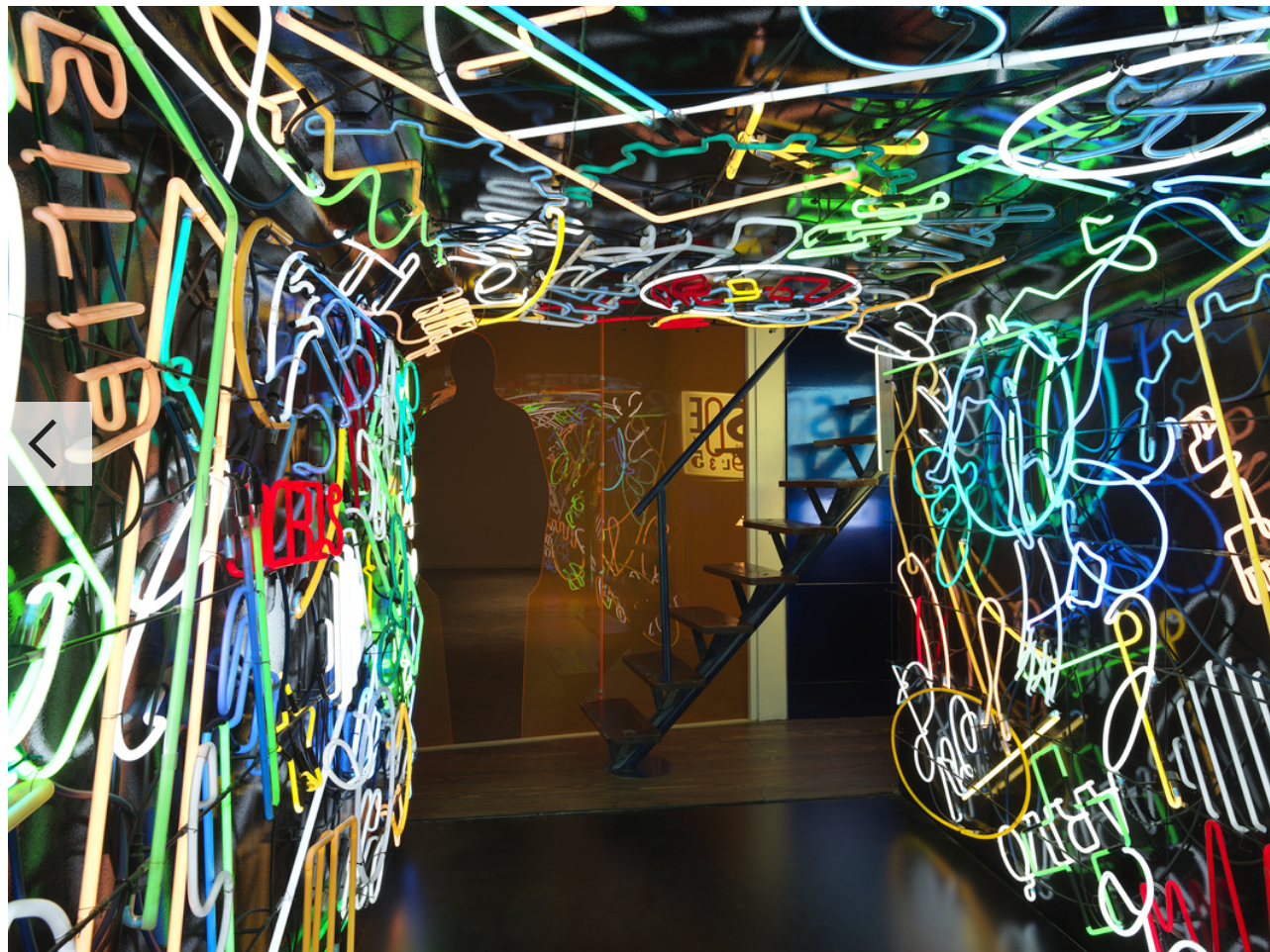
View of “ Marta Minujín: Menesunda Reloaded ,” 2019.