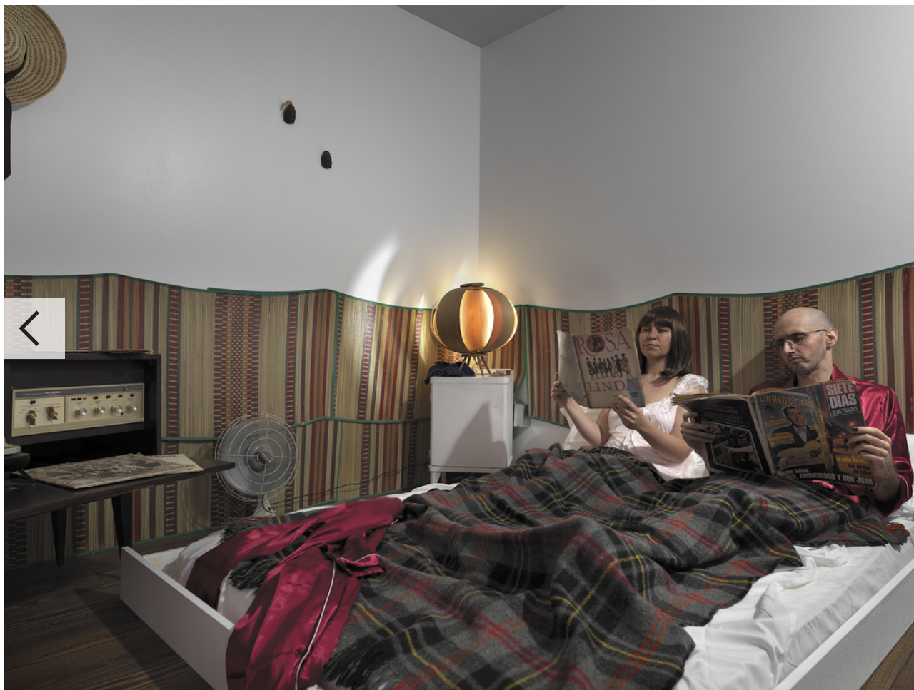
View of “ Marta Minujín: Menesunda Reloaded,” 2019.