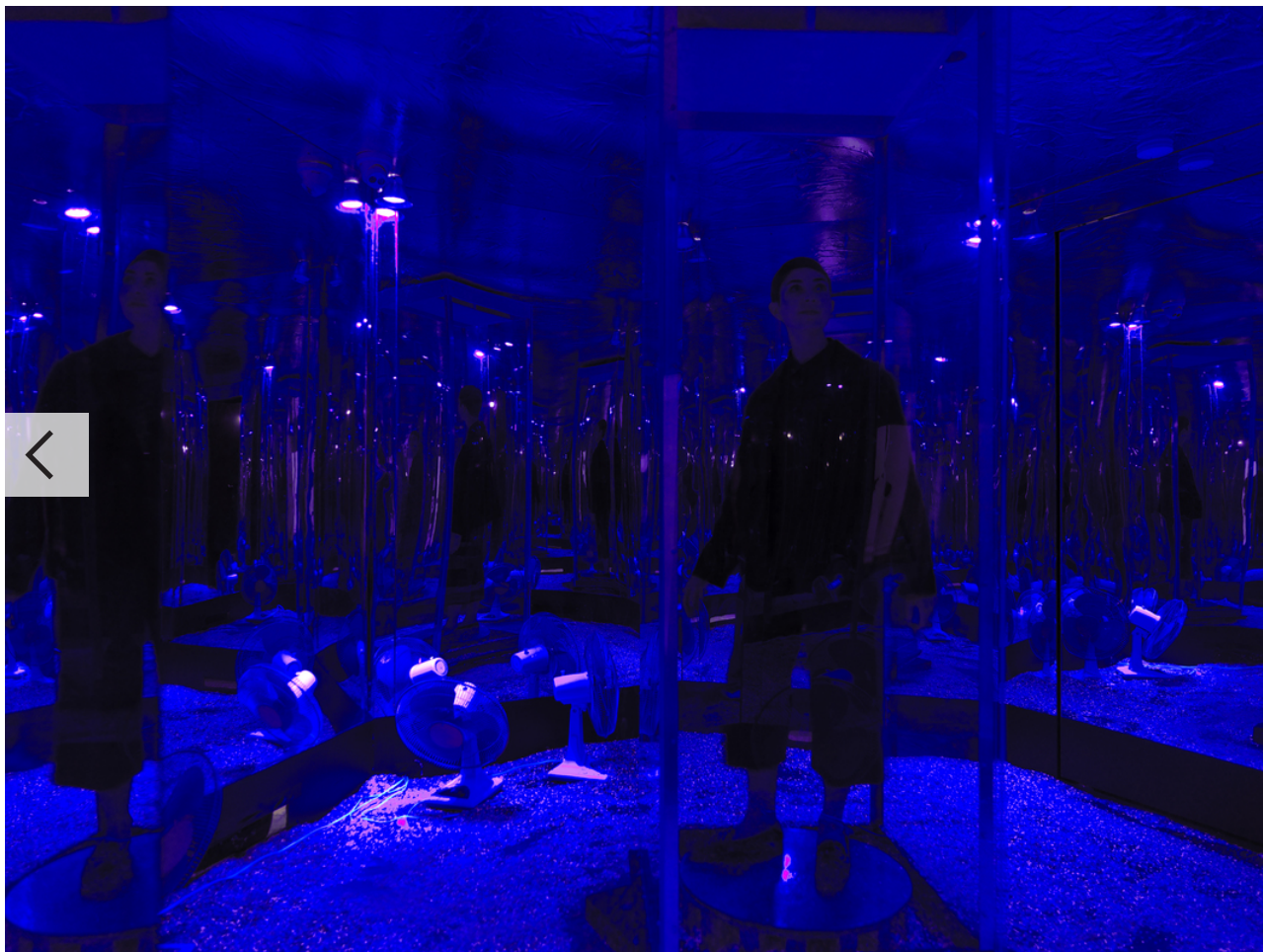
View of " Marta Minujín: Menesunda Reloaded ," 2019.