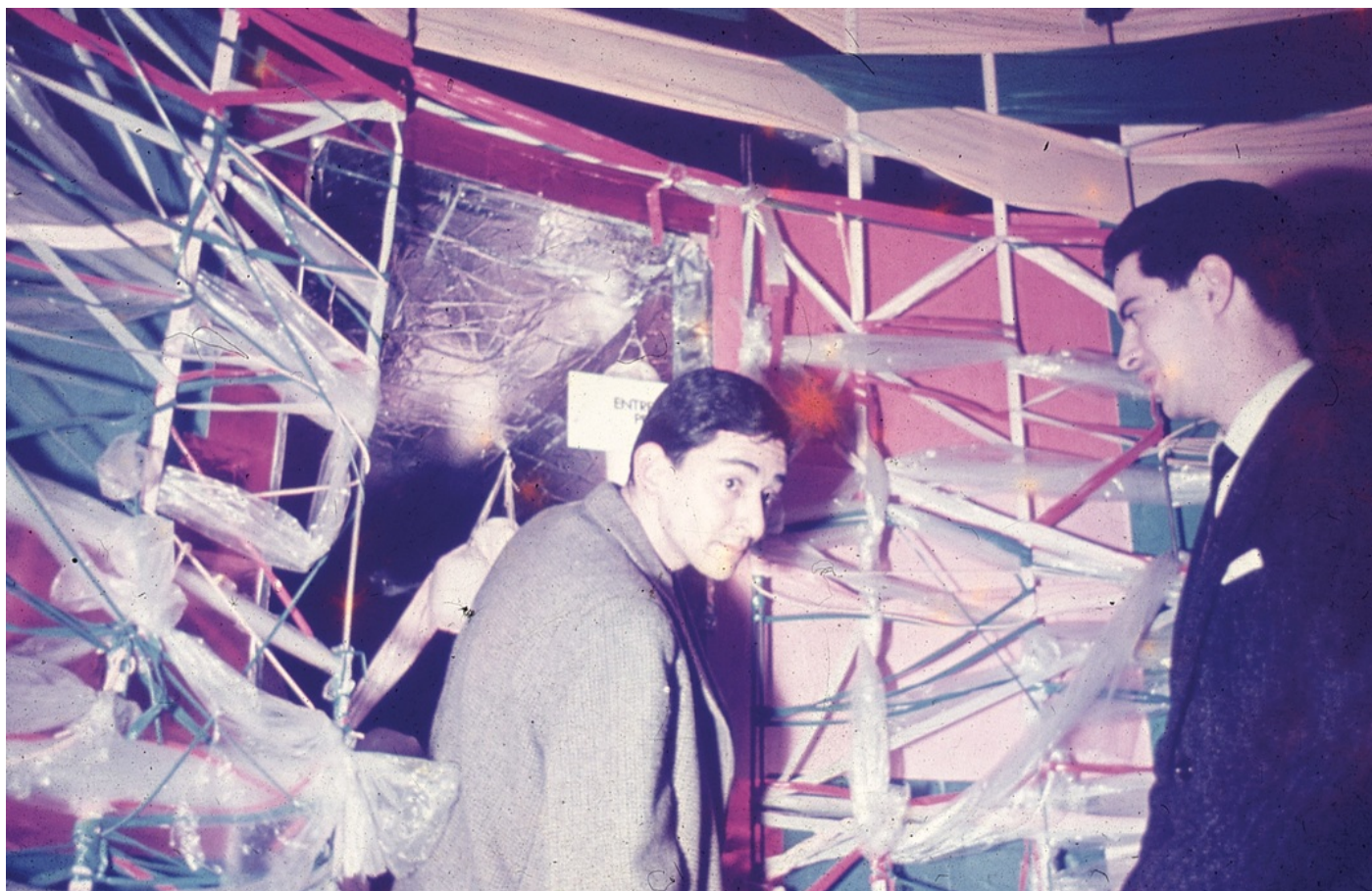
View of Marta Minujín and Rubén Santantonín's The Rotating Basket , from La Menesunda , 1965.

September 17, 2019 • Michaëla de Lacaze Mohrmann on “La Menesunda”